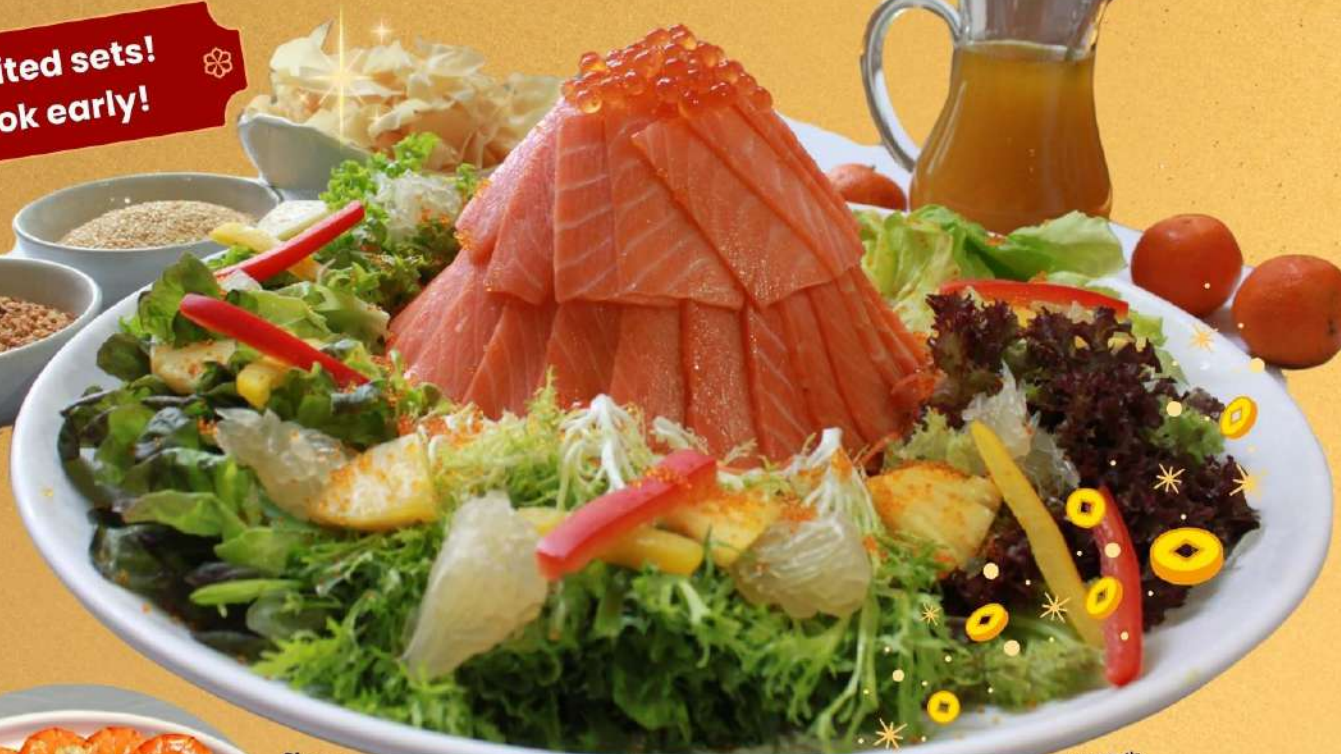
Signature Prosperity Yu Sheng With Salmon And Ikura (Salmon Roe) 禧宴招牌三文鱼发财鱼生