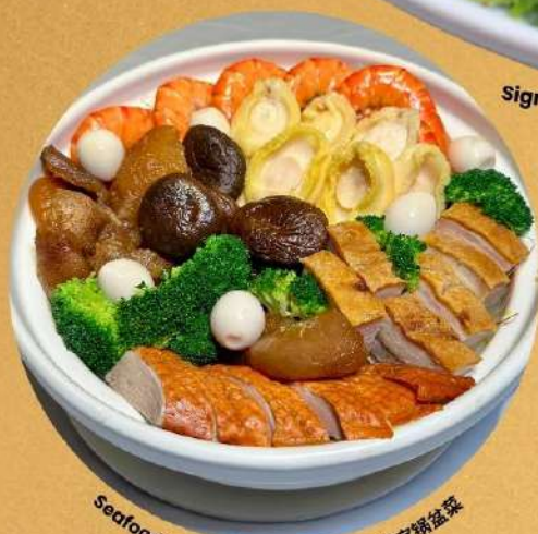
Seafood Treasure Pot Pen Cai 海鲜宝锅盆菜