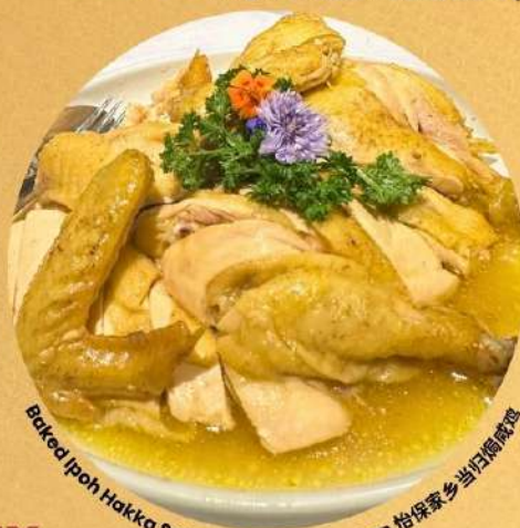
Baked Ipoh Hakka Salted Angelica Chicken 怡保家乡盐焗鸡