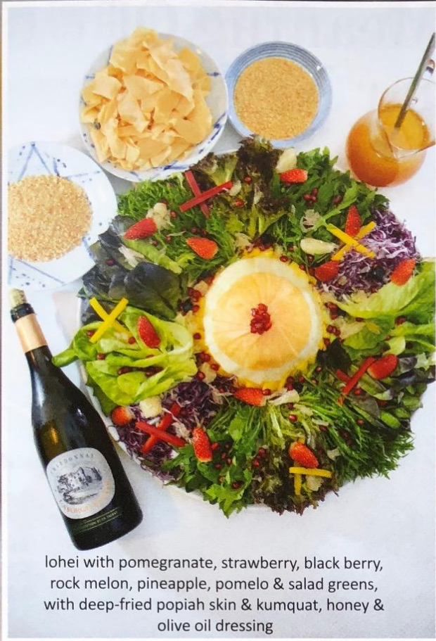
lohei with pomegranate, strawberry, black berry, rock melon, pineapple, pomelo & salad greens, with deep-fried popiah skin & kumquat, honey & olive oil dressing