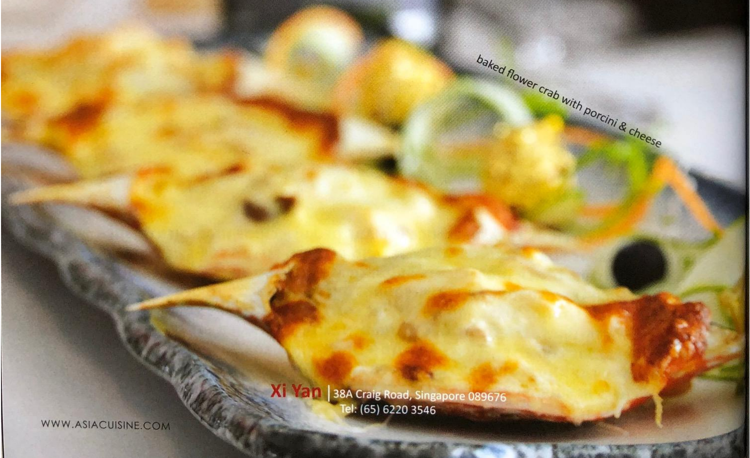
baked flower crab with porcini & cheese

Xi Yan | 38A Craig Road, Singapore 089676 Tel: (65) 6220 3546