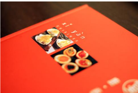
Souvenirs & gifts – Xi Yan Cookbooks; & Customized luxury chocolates (far right)