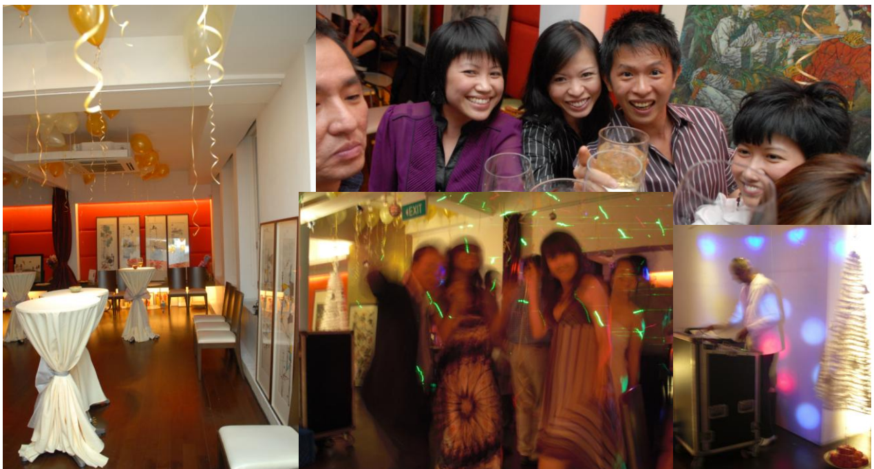
below: Xi Yan dining venue is highly flexible and re-configurable to cater for different kinds of private functions