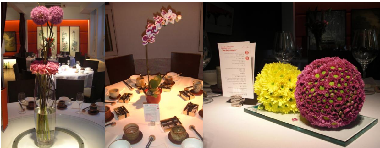
below: Cocktail style party arrangement also available (Xi Yan tapas, free-flow of drinks, DJ music, lots of dancing & laughter!)